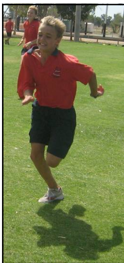
Christian training for the House Cross Country during PDHPE class.

Genius is one percent inspiration and ninety-nine percent perspiration