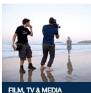
FILM, TV & MEDIA