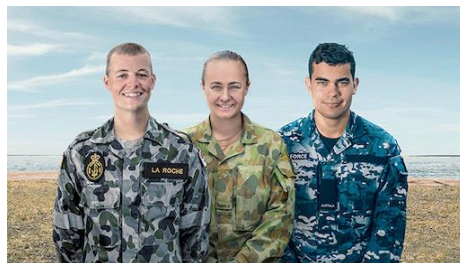
AUSTRALIAN DEFENCE FORCE

Book via https://study.csu.edu.au/life/events